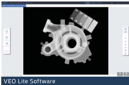
VEO Lite Software

The Alpha S features an intuitive, user-friendly experience. Advanced technology creates user-friendly tools, providing high-quality images, minimal necessary steps and quick implementation. Work fast and easy, while getting reliable results with the Alpha.