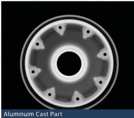
Aluminum Cast Part